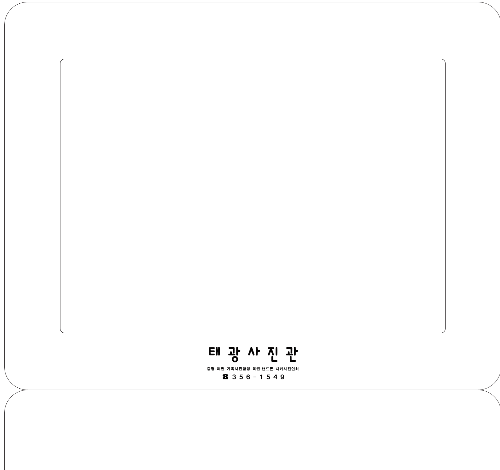
* 5x7 DeltaPocket White / 먹박인쇄